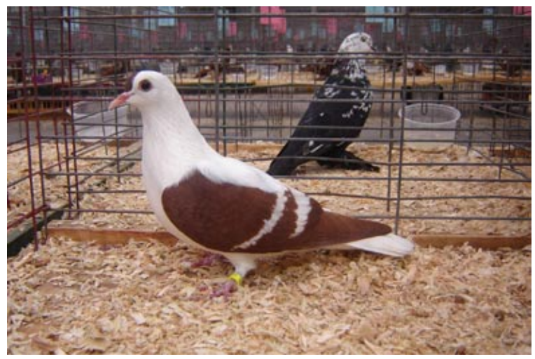
Some nice looking clean leg Wing Pigeons at the NYBS