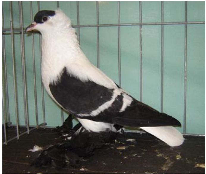
Elliot's Best Fullhead