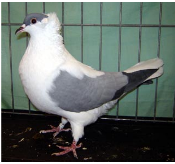
Elliot's Best Thuringer Swallow and Reserve Champion