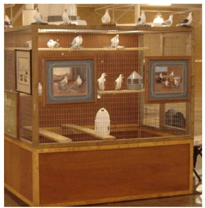
Swallow Display by Jakubowski and House