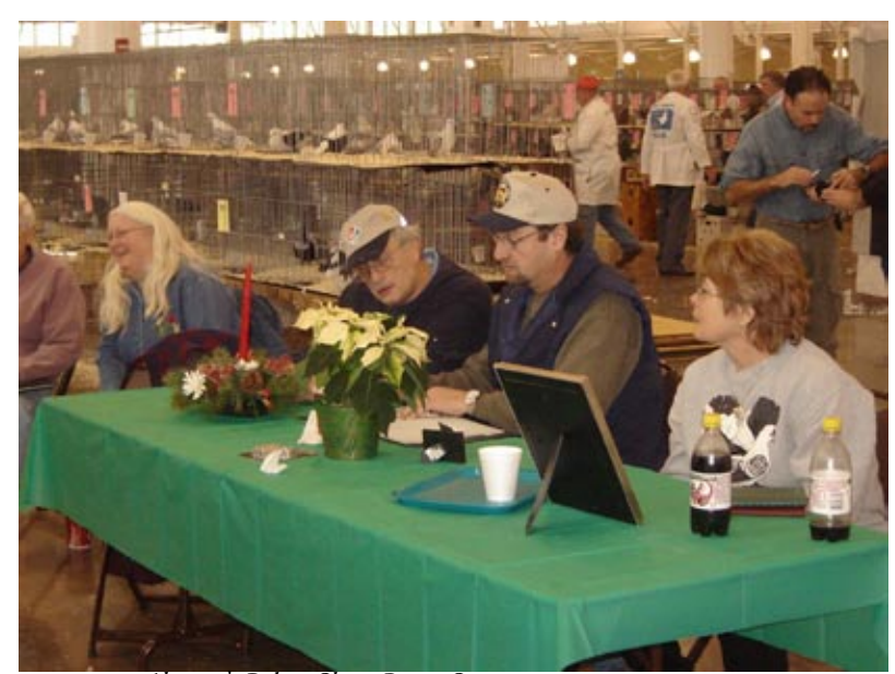
Above & Below Show Room Scenes