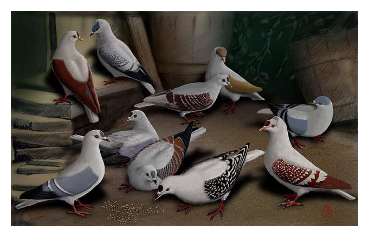
Clean Leg Swallow Group

Further information on this disease can be obtained from federal or provincial/state governmental agencies.