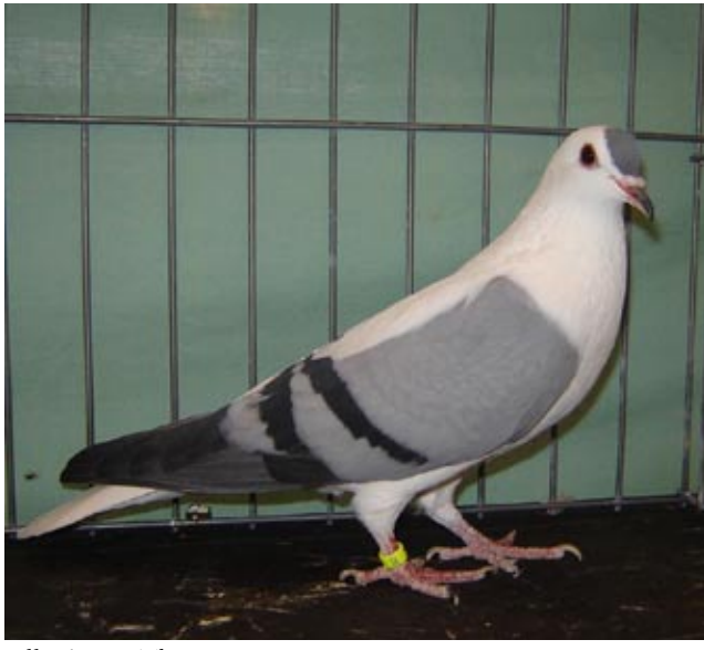
Elliot's Best Thuringer Wing Pigeon